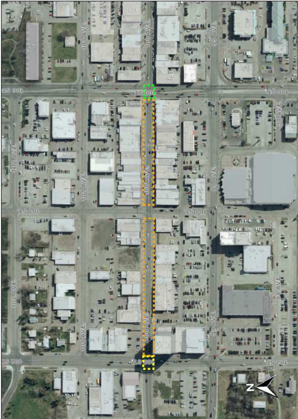
2018 Downtown Rehab Project Limits (100 Ave from 102 St to 100 St).